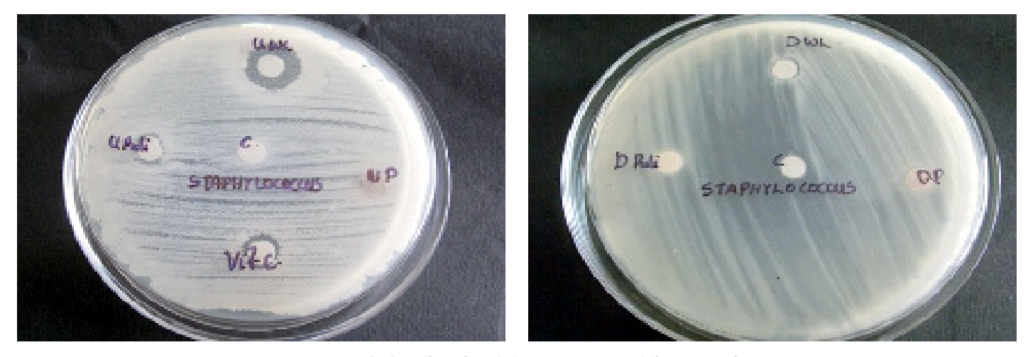
Figure 1(a) and 1(b): Effect of Staphylococcus aureus on different citrus fruits