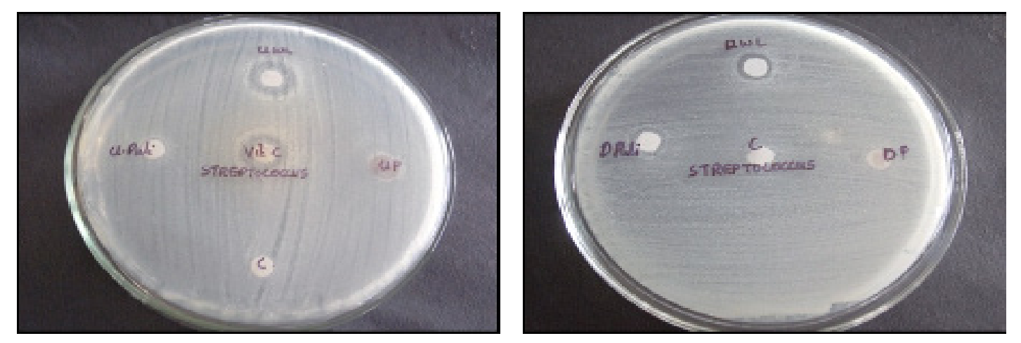
Figure 2(a) and 2(b): Effect of Streptococcus viridians on different citrus fruits.